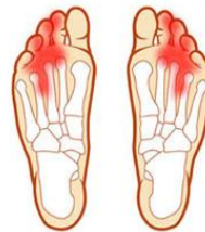
This illustrates the area of the foot affected by Morton's Neuroma

The condition starts out slowly, with intermittent pain. Left untreated, Morton's Neuroma results in permanent nerve damage to the foot. Early diagnosis is always best from a treatment standpoint.