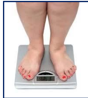
Obesity in children and adults can cause a myriad of foot problems.

And foot problems related to obesity aren't just limited to adults. According to the American College of Foot and Ankle Surgeons (ACFAS), an estimated 16 percent of U.S. children ages six to 19 are overweight and podiatrists are starting to see more overweight and obese children with foot and ankle pain.