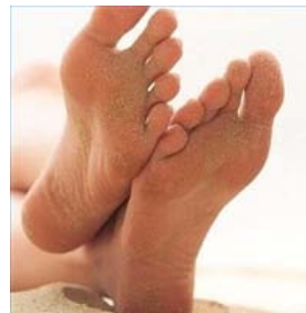
Calluses on the undersides of your feet are common.

Although there are numerous over-the-counter (OTC) corn and callus remover products available, many of these products contain different types of acid that can burn the skin and may cause infection.