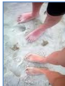
Sunburned feet and ankles cause more than just pain and itching – they can cause deadly cancer